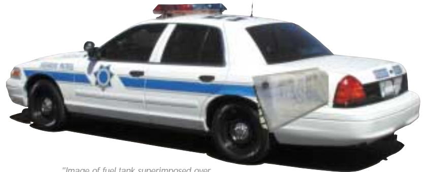
"Image of fuel tank superimposed over CVPI is for general placement information only and is not to scale nor intended to be a technical representation."

To test the FIRE Panel in a “real world” collision, a normally functioning 1999 Crown Victoria Police Interceptor (CVPI) was equipped with two safety enhancements. A FIRE Panel was mounted on the axle side of the fuel tank (see Images 1 & 2),