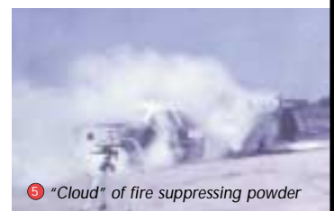
5 “Cloud” of fire suppressing powder

Call us today, toll-free, at 866.607.0747 and learn how a FIRE Panel could make the difference between a devastating fire and a survivable crash.