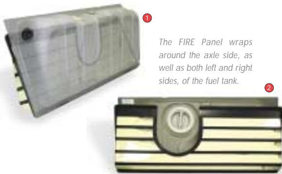
The FIRE Panel wraps around the axle side, as well as both left and right sides, of the fuel tank.