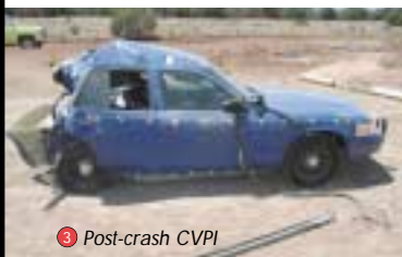
3 Post-crash CVPI

and a bladder was installed inside the fuel tank. The fuel tank was filled with 14 gallons of unleaded gasoline, and the vehicle’s flashers were operating. A pickup truck was then crashed into the rear of the CVPI at 81.9 mph.