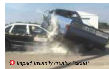
4 Impact instantly creates “cloud”

In a subsequent test conducted by the Automotive Safety Research Institute, a GMC® Sierra pickup truck, featuring conventional “side-saddle” fuel tanks mounted outside of the frame, was outfitted with the same two safety enhancements, a FIRE Panel and a bladder.